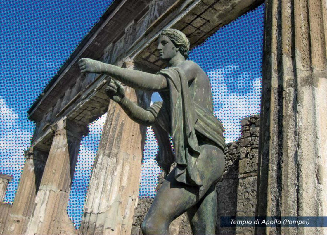
Tempio di Apollo (Pompei)